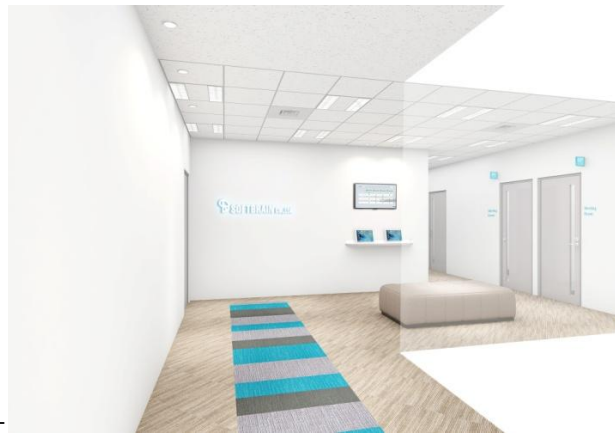
New office entrance image